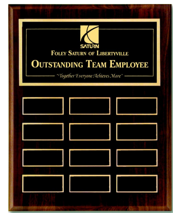
Black brass engraved plates