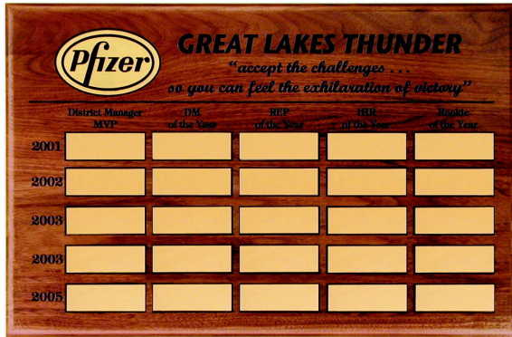
Gold Mylar enhanced logo

Please contact Customer Service for details.