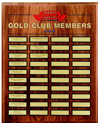
Gold / red / blue highlights