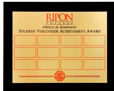
Premier Color imprint / grid on a black acrylic mounting