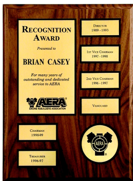
Custom shape plate