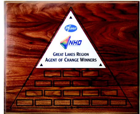
Premier Color / silver plate