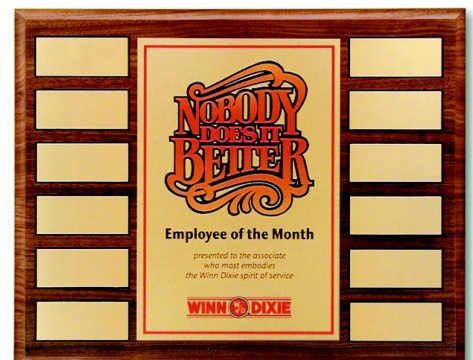
Premier Color on large center plate

Exact PMS color match cannot be guaranteed. White is not available as an imprint color. No full bleed.