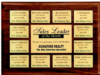
Premier Color imprints