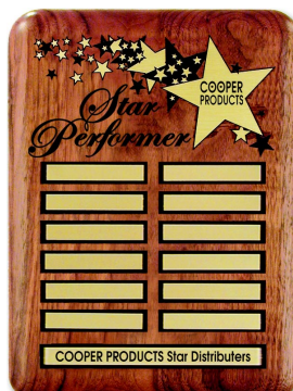
Gold highlights/ curved edge Board